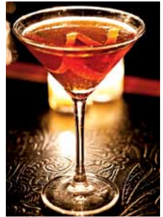
A Manhattan with three bitters at cocktail destination the Gibson.

3 Masa 14 , Logan Circle. For $35 you get all the lychee